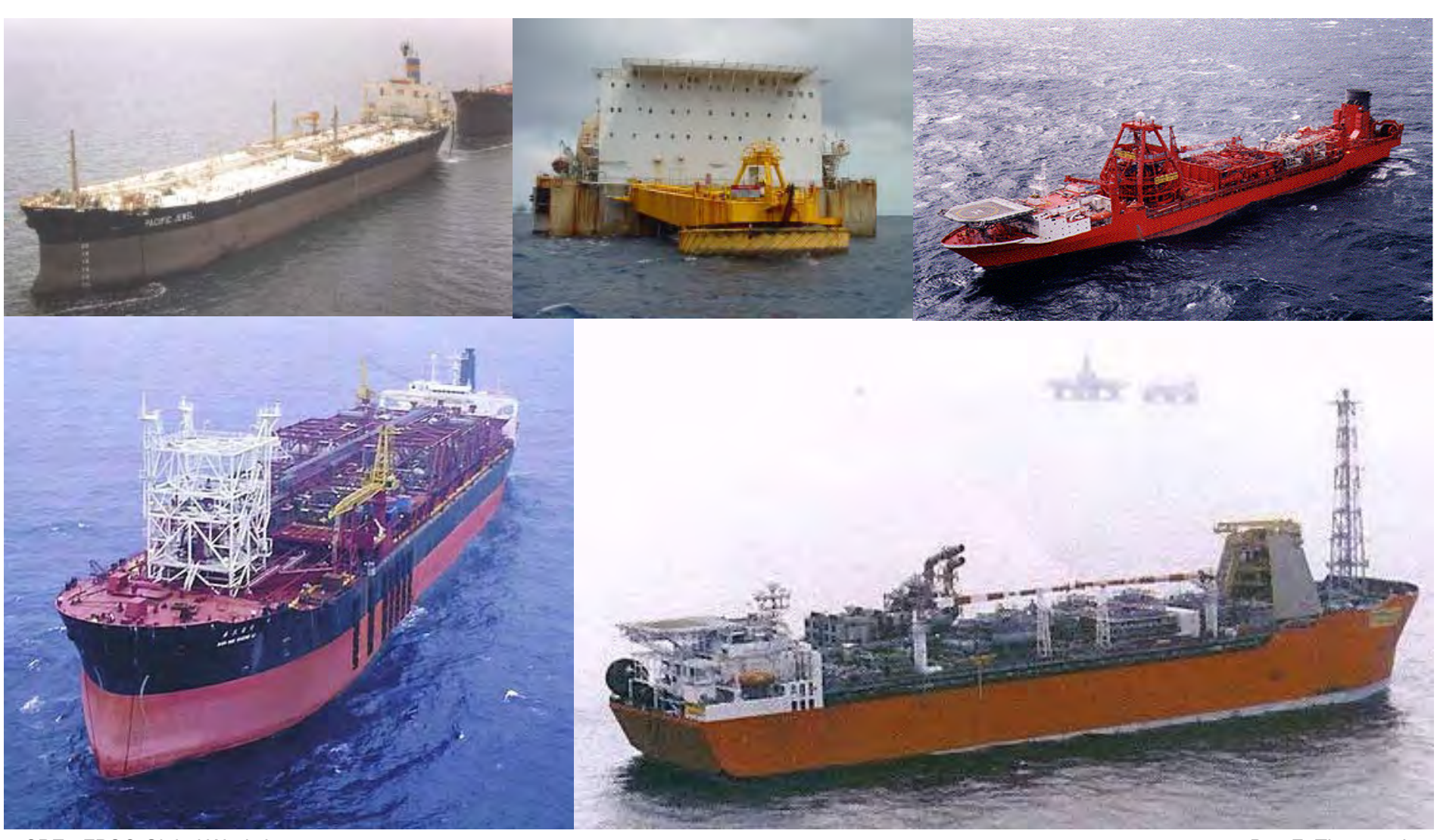
SPE - FPSO Global Workshop September 24-25, 2002